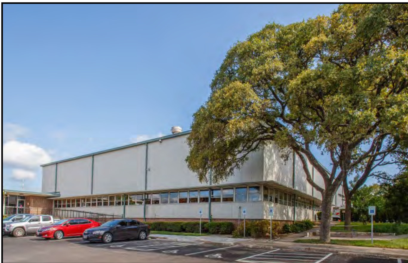
TxDOT's Camp Hubbard

P.S.-Unfortunately there are no more open spots for this training, but we will keep you posted on other upcoming professional development trainings.