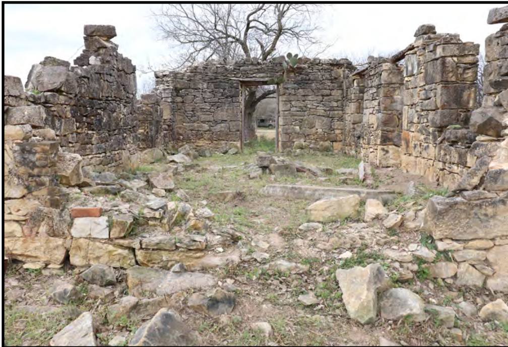
A photograph of the interior of one of the structures, illustrating its limestone construction.