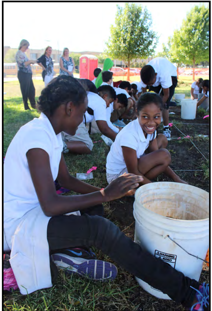
Indian Springs Middle School students excavate at la Pila while their teachers watch.