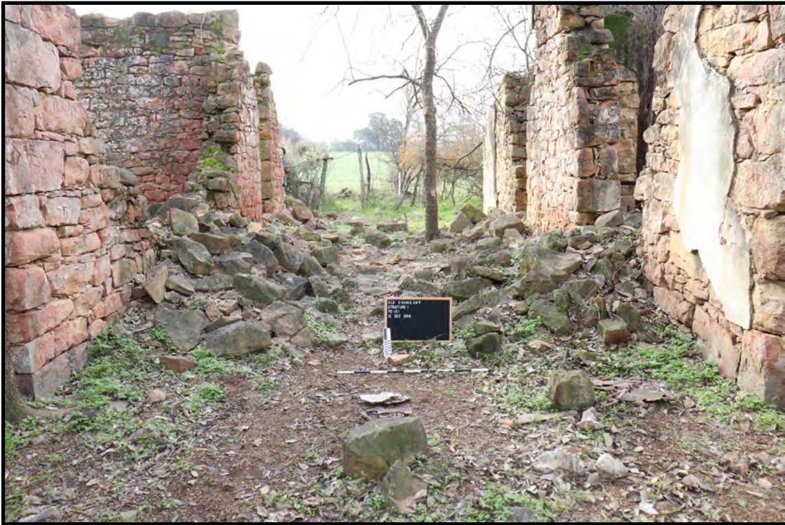
The “dogtrot” area of what was once a stagecoach inn and store in Old D’Hanis, constructed primarily of sandstone (with a later limestone addition, not pictured).