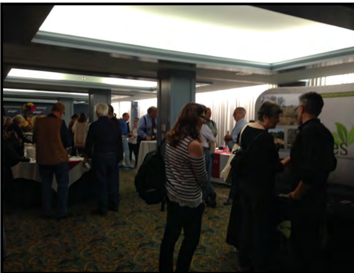
Overview of festivities.