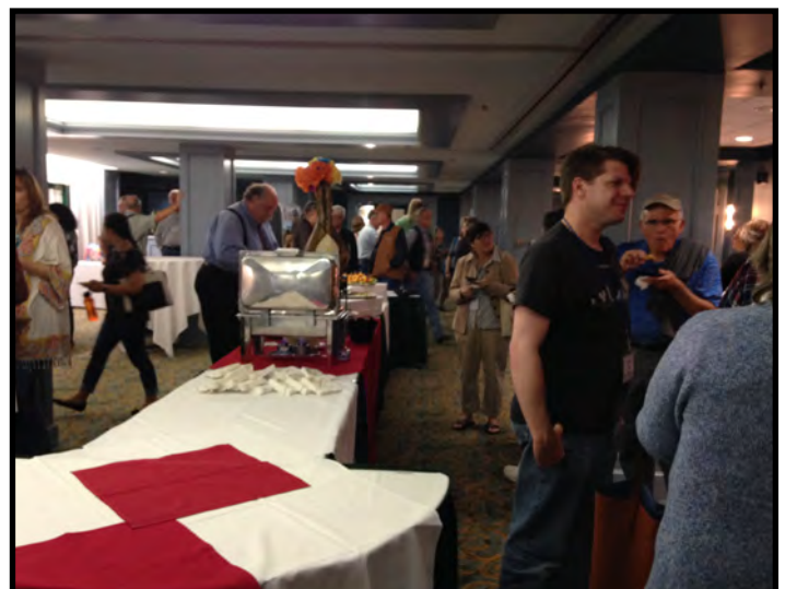
Overview of festivities.