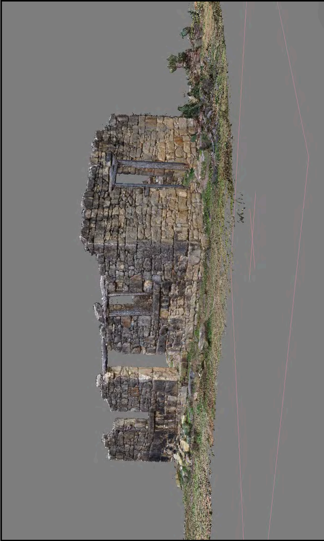
A dense point cloud generated for one of the structures. MetaShape Pro (then PhotoScan Pro) was used to create scaled 3D models of each structure through close-range photogrammetry. Photo by P. Markert, 2018.