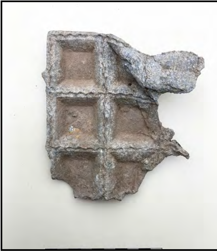
An aluminum ravioli tray, c. mid-20th century. Though the crew did not collect artifacts, they recorded surface finds using the project iPad and scaled photograph board.