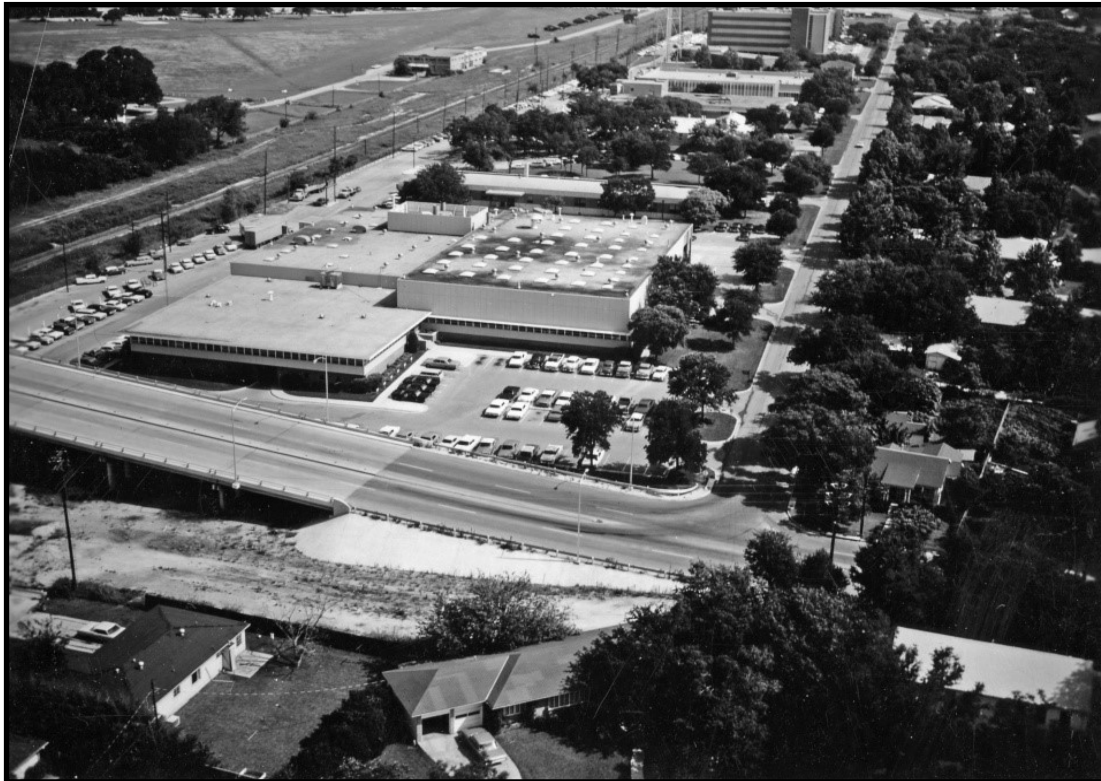
TxDOT's Camp Hubbard