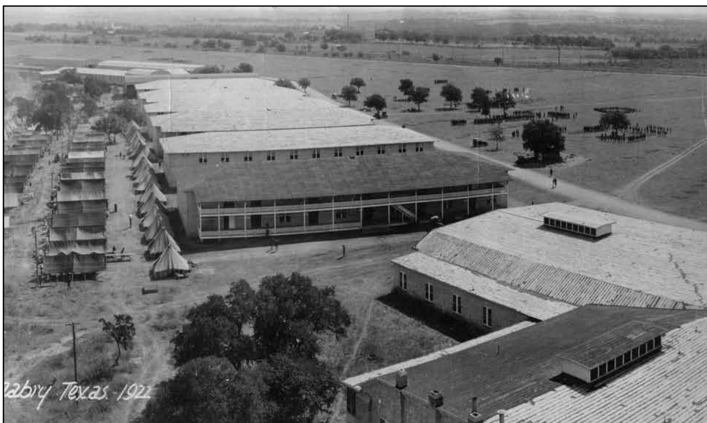
Camp Mabry Barracks 1922