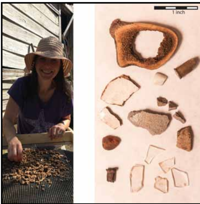
Artifacts from the west side of the house