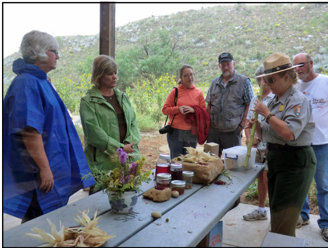
Edible Plant Demonstration

Two native plant demonstrations consisted of: