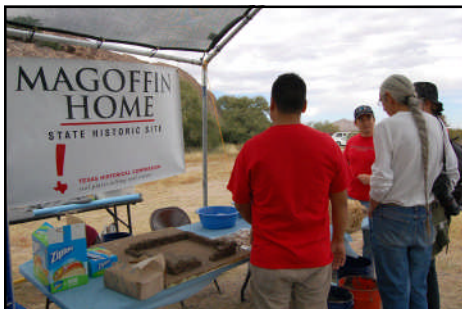
Magoffin Home Adobe

Over 800 people attended Hueco Tanks State Park & Historic Site’s 18 th Annual Interpretive Fair Weekend, held on October 20 and 21, 2012. The fair promotes awareness of archeology, cultural history, and stewardship at Hueco Tanks and throughout Texas. This year’s fair hosted the Mescalero Apache Dance of the Mountain Gods (or Gahe) Ceremony, in addition to many other attractions.