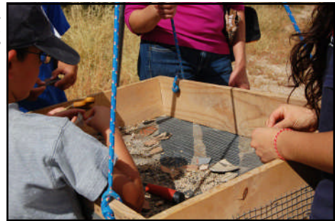
Hands-on UTEP Archeology Techniques