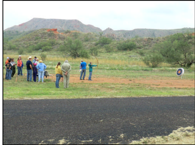
Atlatl Throwing and Archery

Evaluations by uniformed NPS staff and Friends volunteers were positive, offering thoughtful criticisms and valuable suggestions that will be incorporated into the planning for FlintFest 2013.