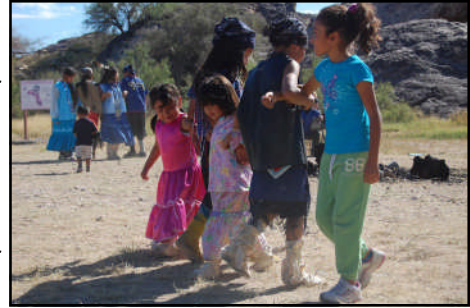
Mescalero Apache Social Dances

The Interpretive Fair Weekend is a family-oriented event held annually on the third weekend in October, during Texas Archeology Month. The fair is free to the public.