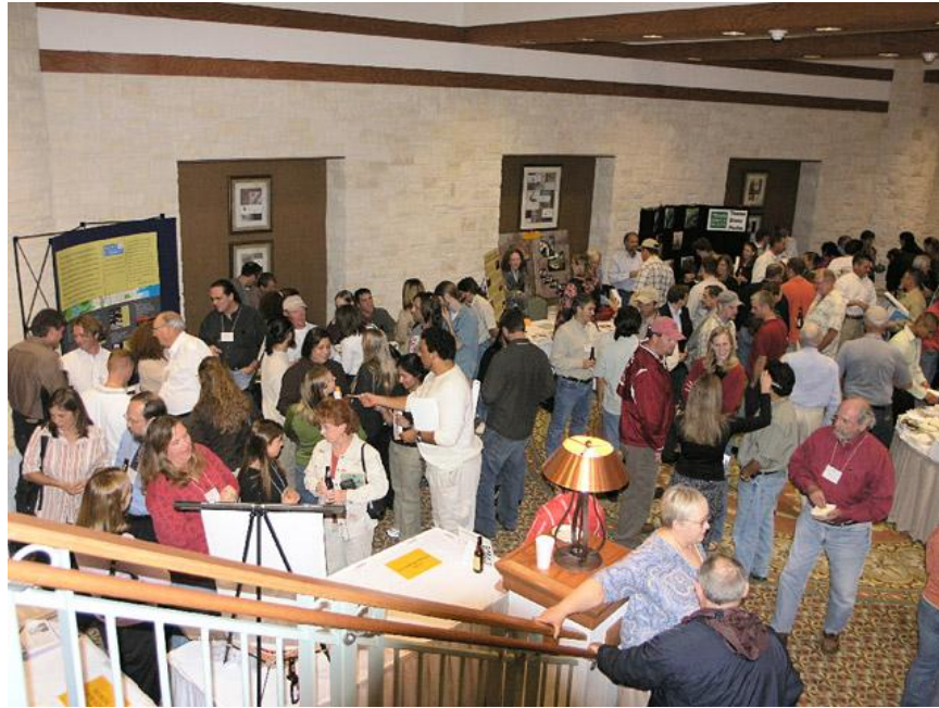
Exhibitors from various state agencies, cultural resource management (CRM) firms, and universities chat with visitors about the archeological work they conduct or teach.